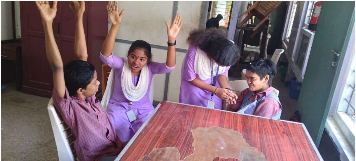
12. PTA Meeting held on 27-02-2023